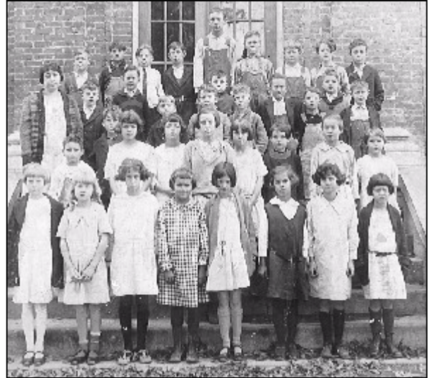
1920's Ashland City Elementary Class